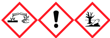
Corrosion Exclamation mark Environment